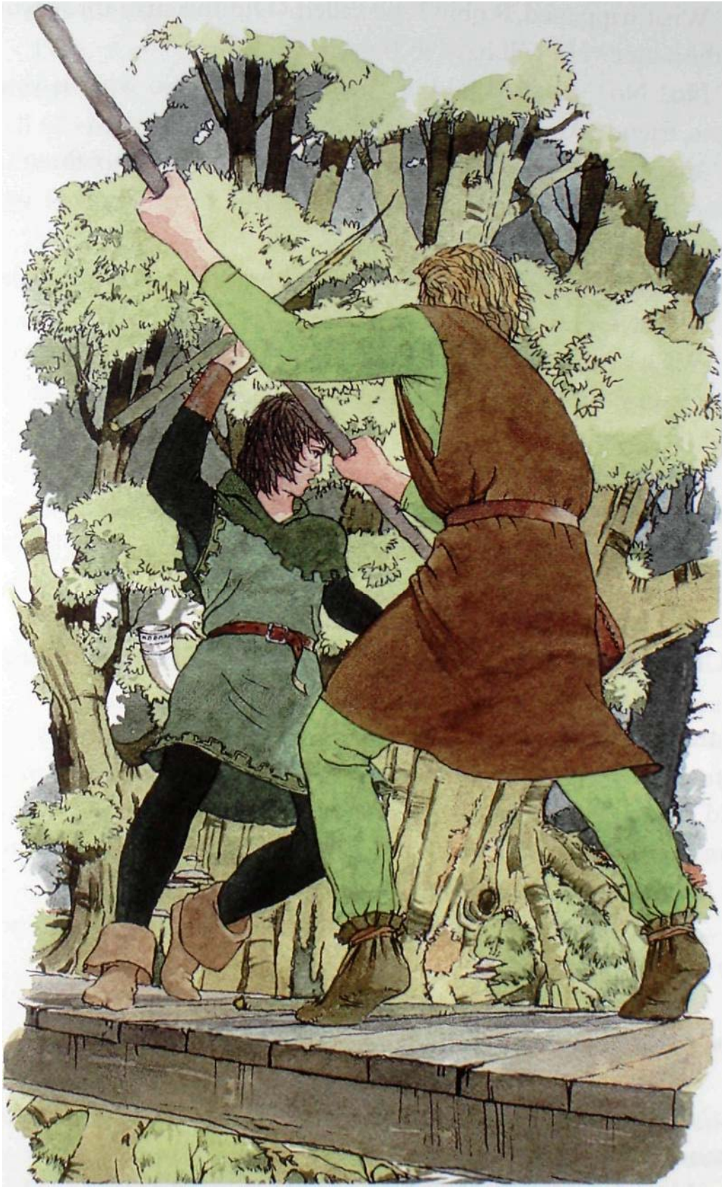
They fought there, in the middle of the bridge.