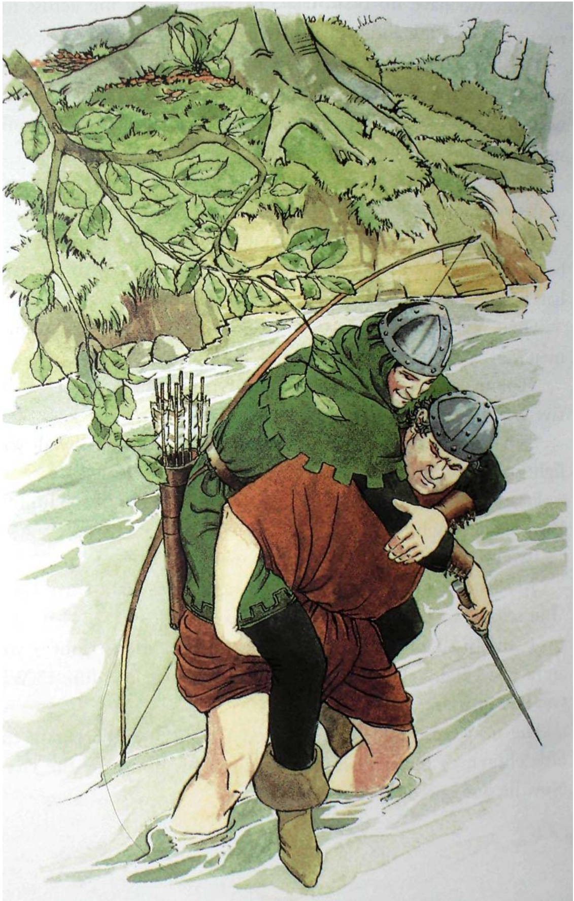
The friar looked at Robin's sword and then walked into the water.